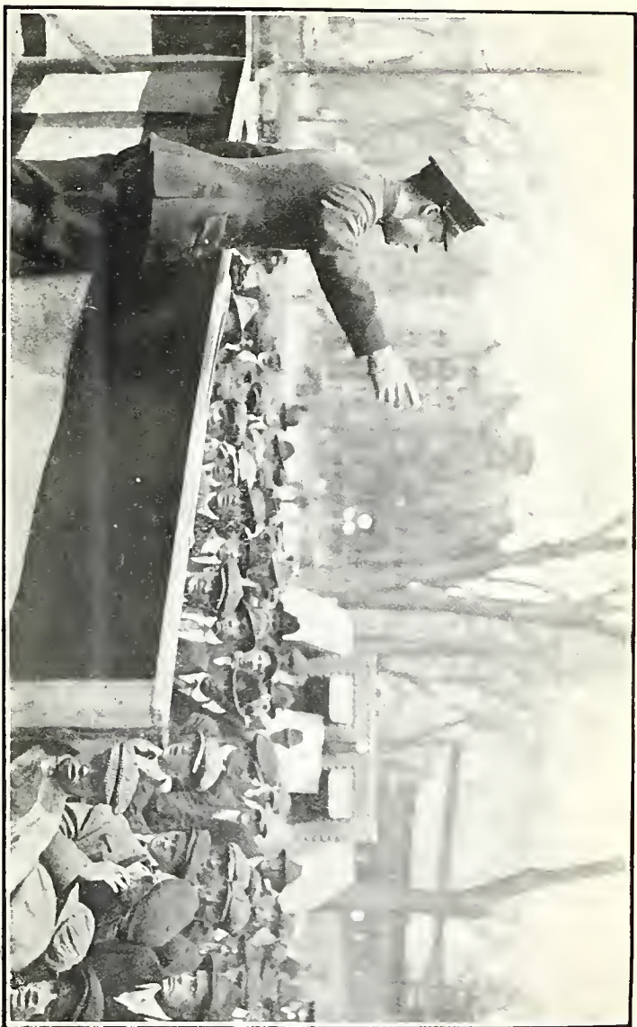
THE AUTHOR APPEALING FOR RECRUITS FOR THE AMERICAN TANK CORPS, WATERBURY, CONN., U.S.A.