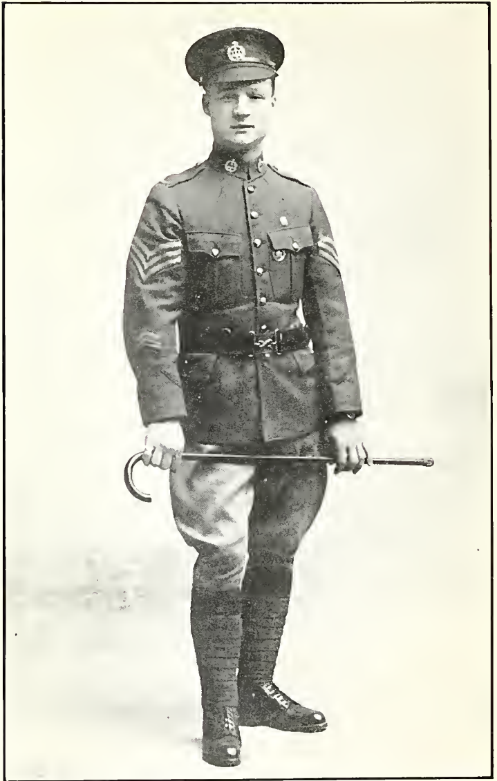
THE AUTHOR AS HE APPEARS TO-DAY.